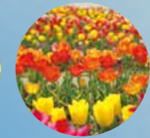
Tulip (early Apr. - mid Apr.) Hanaryu Road