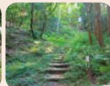
Ecological Park entrance Fun with Nature "Guided Walks" Sanuki Woods Walking Trail