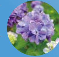
Hydrangea (early Jun. to late Jun.) Hydrangea Garden