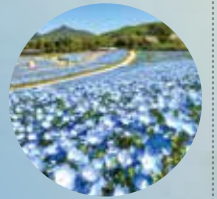
Nemophila (early Apr. to late Apr.) Hana-Meguri Hill/Hanaryu Road